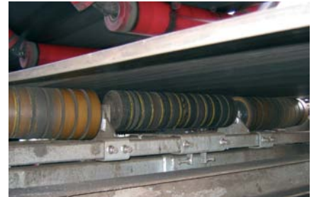
The New Tracker Roller RRG2 in Operation

Suitable for belt widths of up to 2.4 metres, the new version of the tracker rollers can be used for speeds up to 6 meters per second. With its conical outer roller, the tracker roller RRG2 is specialised on effectively guiding reversible conveyor belts. The rollers type RRG2 and also RG2 are designed