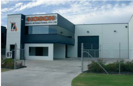
More Space for HOSCH International

At the beginning of 2007, HOSCH International moved into a larger building