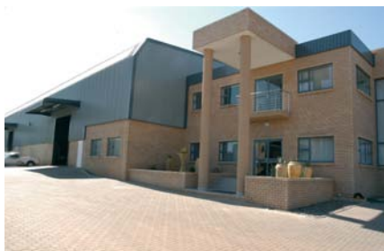
Modern and Spacious: the HOSCH S.A. Building

The new HOSCH building is situated in an industrial area, not far away from Johannesburg international airport. The