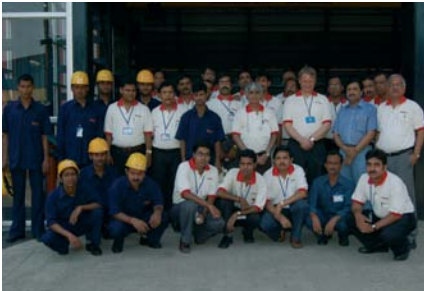
Thirsty for Action: The HOSCH India Team