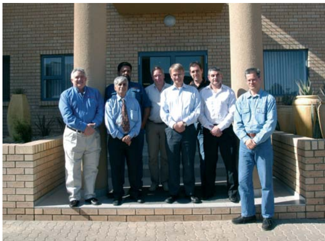
Welcome to South Africa: The HOSCH Managers Held Their International Management Meeting in the New Building