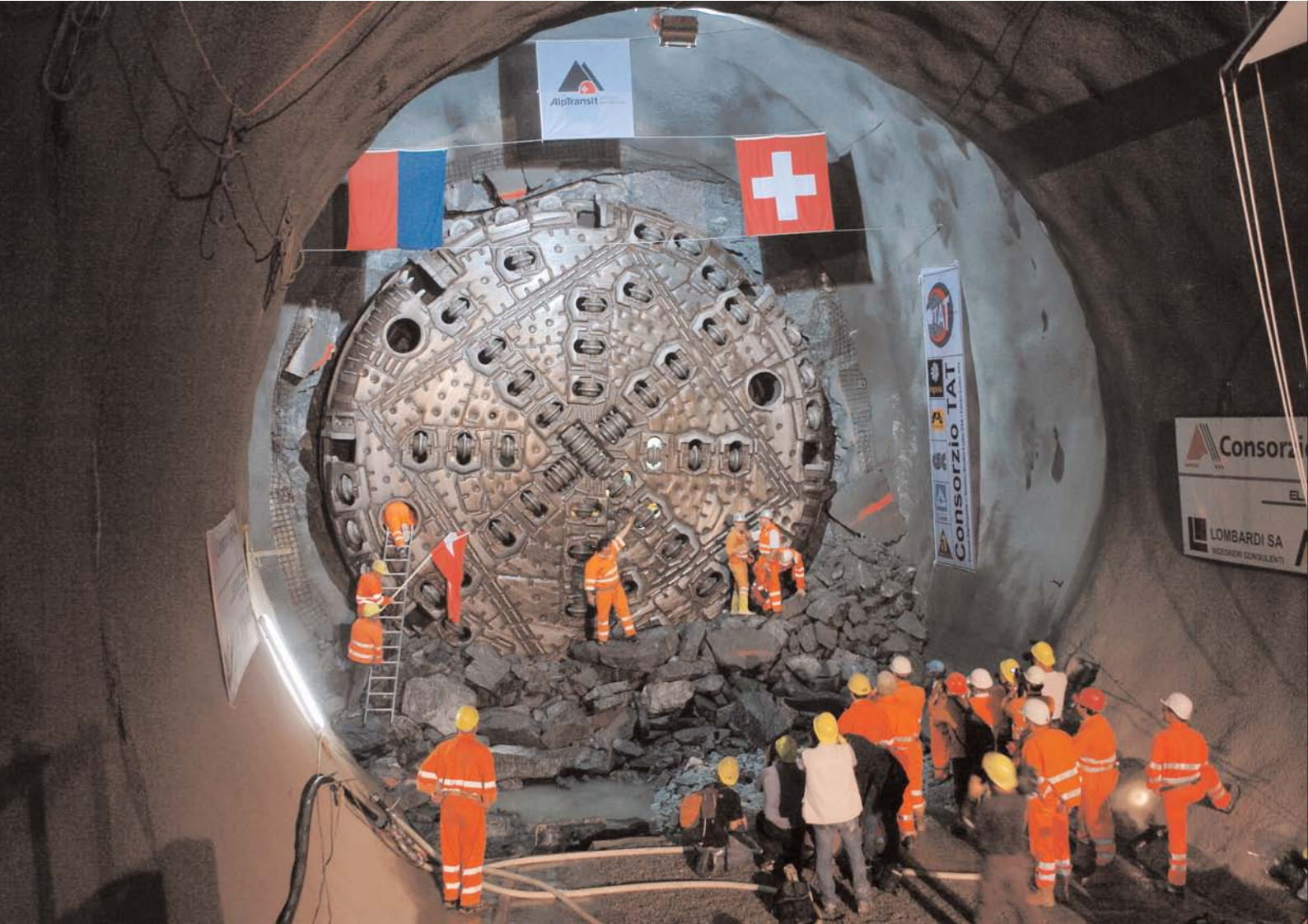
Interim Goal Achieved: Construction Workers Celebrate Opening of Eastern Tube in Faido