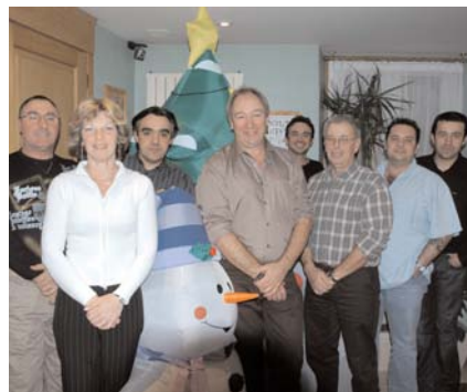
A Team Which Work Well Together