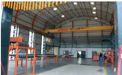
Production Can Start