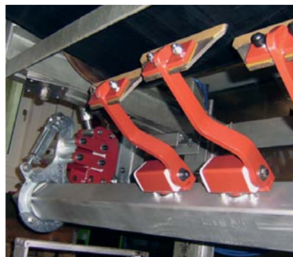
Trial of the New HFA Type C4

Bigger, wider, faster: The opencast mining causes special problems for scrapers and belt cleaning systems. There are working conveyor belts with a width of up to 3.2 metres and speeds up to 7.5 m/s – and this up to 24 hours a day. And on top of that the conveyed material can be loamy and sticky or sandy and dusty. This challenge has been taken up by the HOSCH Department of Research and Development.