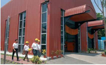
Tour of the New Buildings