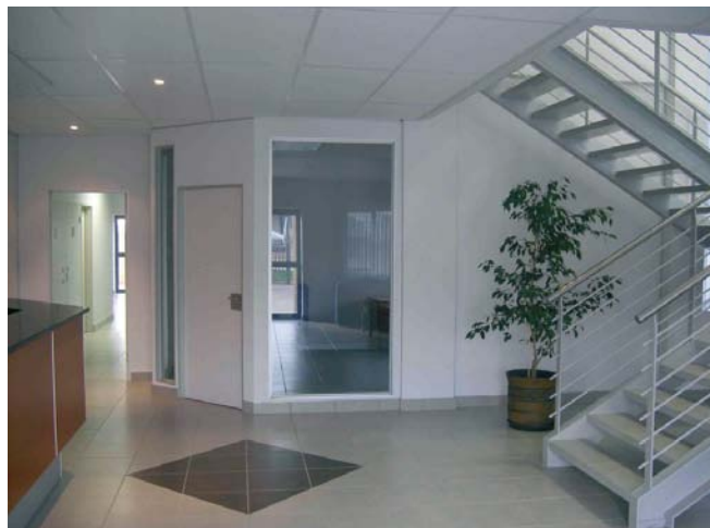
Light and Friendly Colours Set the Tone in the Reception Area