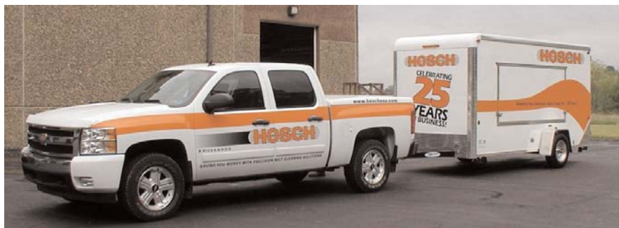
Ready to Start: HOSCH Company Takes Powerful Trailer on Tour