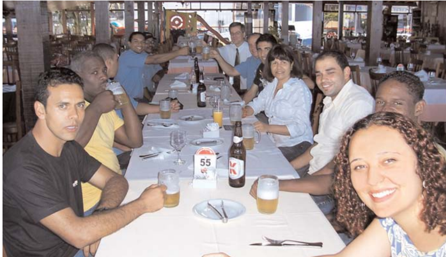
Cheers, HOSCH do Brasil! The employees drank together to the 10th anniversary