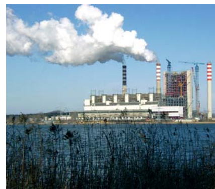
Full power: the power station of Patnow

Krzysztof Lebioda also sees a lot of opportunities for HOSCH Polska