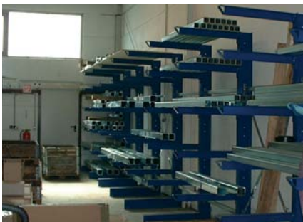
The warehouse in Factory II is well arranged

"In the new warehouse, we have enough room for processing all our orders quickly and reliably", Plogmaker says and points to huge heavy-load shelves on the wall. Pallets and boxes are piled up on four levels. Tubes, steel cylinders, screws and threads are arranged accurately. On a workbench, there is a scraper system