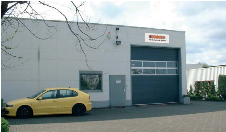
Expansion at headquarters: HOSCH procures additional storage capacity in Factory II