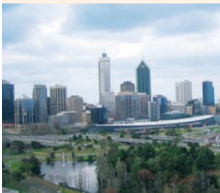
The skyline of Perth

Strictly speaking, Perth is a “small town” with only about 13,000 residents. Those who speak of the West Australian town, however, in most cases think of the “Metropolitan Area Perth”, which consists of 30 additional independent communities in the peripherals. With about 1.5 million residents Perth therefore has to be assigned to the big cities. With up to 14 hours of sunshine per day Perth, which is located on the Indian Ocean, is called “Alunga” – city with a lot of sun – by the Aborigines. In the city centre you can find banking areas and the stock exchange, the entertainment district Northbridge and a long shopping street. “Life and soul of the city” is the Kings Park, an area of 400 hectares in the outskirts of the town with botanical gardens, restaurants, sports facilities, memorials and picnic sites.