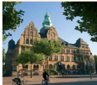
The Town Hall in Recklinghausen

The district of Recklinghausen is situated in the north of the Ruhr area between the rivers Emscher and Lippe. The region is characterized by a sound mixture of industry, nature and culture. Cycle tracks and bridle paths stretching for miles as well as canals and waterways are inviting for sporting leisure activities. Also culturally the hometown of HOSCH has a lot to offer. From the tradition “culture for coal” the “Ruhrfestspiele” have developed, an annual theatre festival, which meanwhile has gained a good reputation all over Europe, and which was able to attract stars like Kevin Spacey. The building, which had received a prize for architecture in 2001, is also the domicile of the orchestra “Neue Philharmonie Westfalen”. Attractive day-trip destinations are the zoo, the observatory and a listed transformer station, which affords an insight into the history of electricity. The structural change becomes especially obvious in the “Landschaftspark Emscherbruch”. Here, former slagheaps have been redesigned into a sporting, recreation and cultural park.