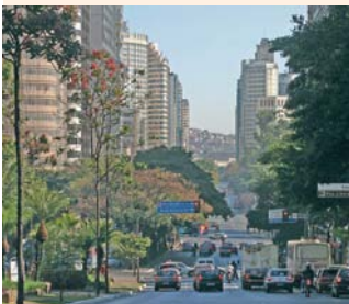
Broad streets are typical of Belo

“Beautiful horizon” is the English translation of the name of the home town of HOSCH do Brasil. The metropolis is the largest economic centre in the south of Brazil with most of the industrial plants located in the region of Minas Gerais. The city is reputed to be one of the best places to live in the whole of Brazil. Also for tourism the region becomes more and more attractive. Wide main roads and a lot of green areas are the main features of the city. Leisure activities are offered by various theatres and a manifold gastronomy. Also the “Mangabeiras” Park which offers its visitors a marvellous view to the beautiful horizon of the metropolis is worth a visit.