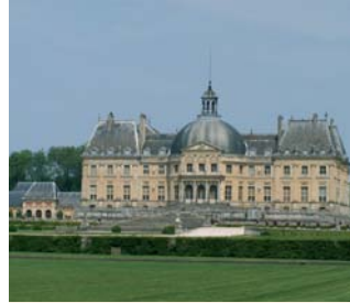
The palace of Vaux-le-Vicomte

Réau is the smallest of the “HOSCH towns”. Just about 700 residents live in the community on the Seine. The capital Paris, however, is only about 50 kilometres away. In the immediate vicinity you can find the town Melun, which has already been described as a significant settlement in the very first records of the Gallic War (appr. 50 B.C.). A special place of interest in today’s Melun is the palace Vaux-le-Vicomte with its palace gardens, which served as a model for the palace of Versailles. Especially in the evenings, when the palace is bathed in candlelight, a visit is worthwhile. If you meet persons in uniform in Melun, you shouldn’t be surprised – Melun is the headquarters of the officer candidate school of the French Police. With Anna Gavaldà, authoress of the best-seller “Ensemble c’est tout”, the town has its own famous resident.