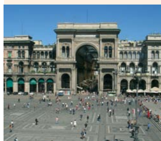
Shopping on the Piazza del Duomo

Milan is Italy's largest industrial metropolis and at the same time one of the most important industrialized areas in Europe. Half of the major companies are situated here. Therefore the canals, the “Navigli”, which had been designed by Leonardo da Vinci in the 15th century, were of great importance for the commercial centre. Also the famous fresco “The Holy Communion”, which is exhibited in a Milanese museum, gives evidence for the most famous inhabitant of the town. For friends of the opera a visit of the legendary opera, the “Scala” is simply a must. The cathedral of Milan presents a masterpiece of the Italian Gothic period. And of course Milan is also a fashion metropolis – fashion victims like to stroll through the “Galleria Vittorio Emanuele II”, a splendid shopping arcade. The Milanese keep their fingers crossed for two internationally successful football teams: AC Milan and Inter Milan.