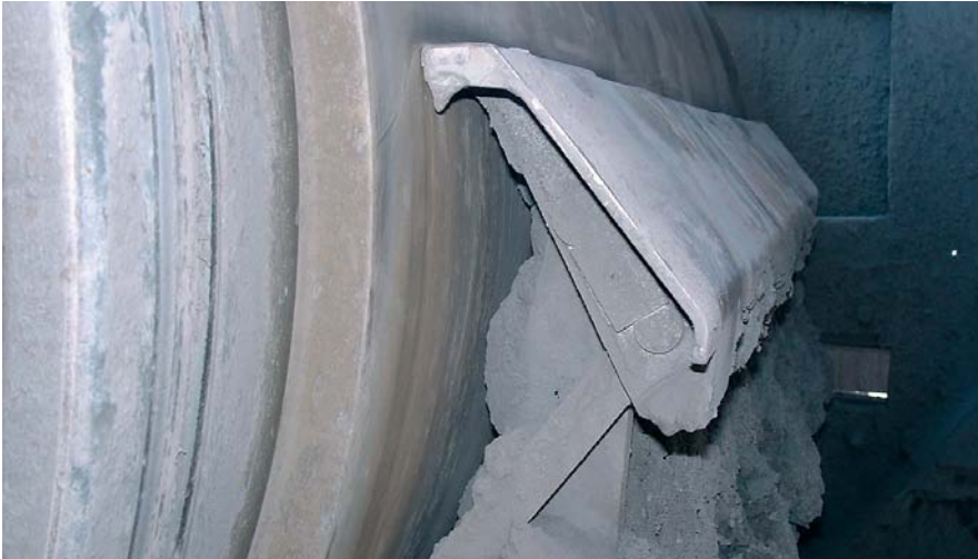
Neat work: The new HD scraper supplies excellent results