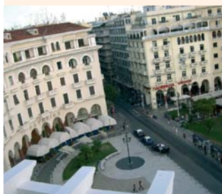
View to Aristotle Square

Who wants to catch a perfect view onto the Olymp, is just right in Thessaloniki. The capital of the Macedonia region is located just vis-a-vis to the mountain of the gods. 2300 years of an exciting history with traces left behind by the Romans, Byzantines and Ottomans have formed the