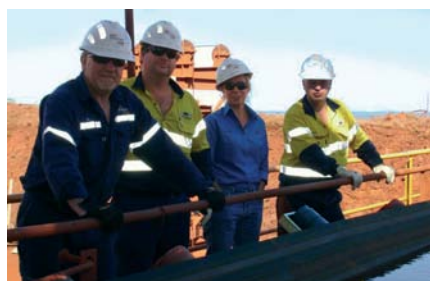
Convinced: the team at Cape Lambert

They set new standards in the field of conveyor belt tracking: the tracking roller types RC2/3, RRC2/3 and RRC2-V. The systems that work on both the top and return strands of the conveyor belts passed their first acid tests. At the beginning of 2008, the HOSCH GB service force installed eight of the new tracker rollers at four different customer sites.