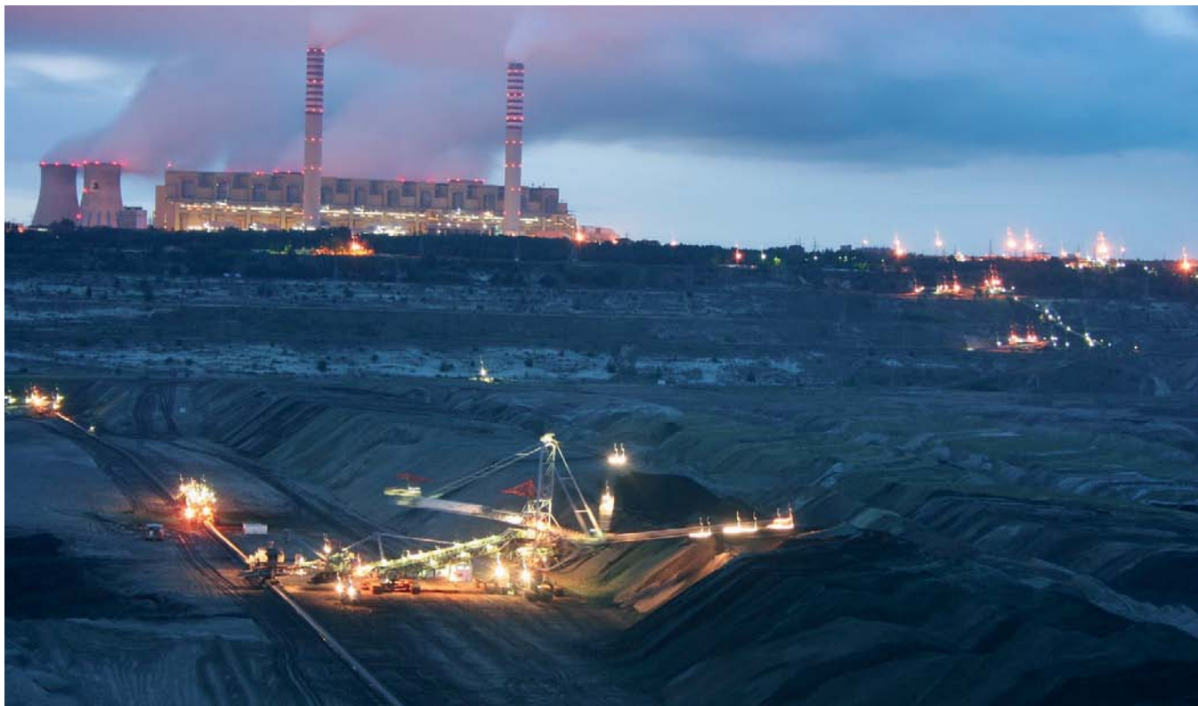
Generation of energy in XXL format: the open-cast lignite mine and the power station in Belchatow