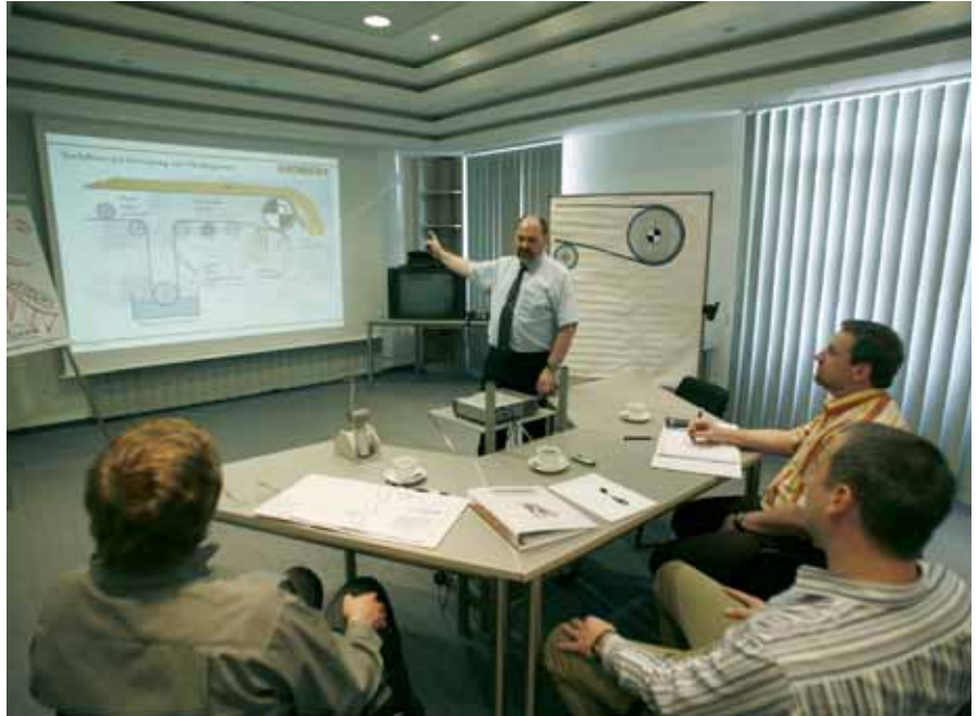
Professional: Employee training in the HOSCH training centre in Recklinghausen