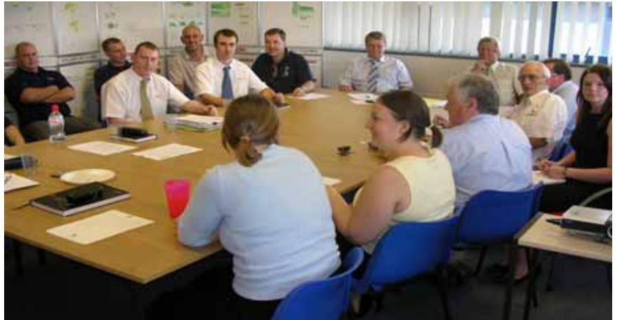
Harmony at a large table – the HOSCH GB team at their half-yearly conference