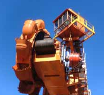
Iron ore for China's booming industry