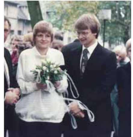
Once upon a time – the wedding in 1981