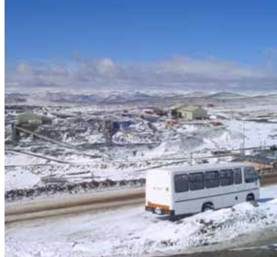
Lesotho – on the way in snow and ice