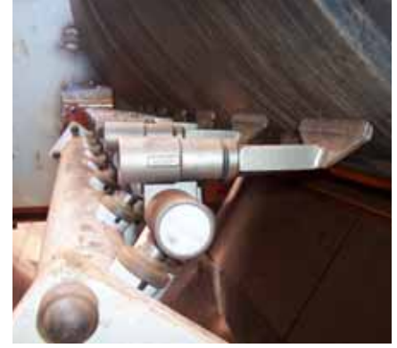
State-of-the-art scraper technology from HOSCH