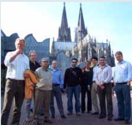
Imposing backdrop – the IMM participants in front of Cologne Cathedral

For more than 40 years, RWE Power Station Niederaußem has supplied power to the region where it is located. On 11 October 2006, a day-trip to the giant power station near Cologne was organised for the participants of the 21 st International Management Meeting. During the guided tour of this long-established power station, the visitors could also have a look at the newly developed HOSCH disengaging device. Afterwards, the RWE hosts invited the HOSCH delegation for a delicious lunch in the works canteen, where everybody ate in a happy atmosphere. A walk through Cologne was the next item on the agenda. Everybody had a terrific