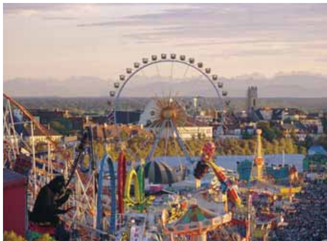
“Oktoberfest“ in Munich is the biggest fair in Germany