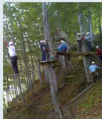
Balance and power – not only on the tight-rope in the jungle park

Out of the training room, into the adventure. During a very unusual customer workshop organised by HOSCH Polska in Szczyrk (Upper Silesia) on 8 and 9 September 2006, more than 30 participants were given the opportunity not only do prove their intelligence but also show their athletic skills and their physical fitness. On horseback through the wood, at a tightrope act or during an act of strength in the jungle park, or at a paintball shooting competition – immediately upon their arrival, the group plunged into adventure. “Everybody welcomed this change”, the General Manager of HOSCH Polska, Krzysztof Lebioda, says. The second day, there was training for the employees of the customer companies – members of staff of mines, coking plants and ironworks attended the seminar. In these workshops, they were informed about the necessity of regular service and about the different applications of original HOSCH spare parts. “This is the only way of asserting ourselves against our strong competitors in Upper Silesia”, Krzysztof Lebioda says. “By organising this adventure experience, HOSCH has been able to win additional points”.