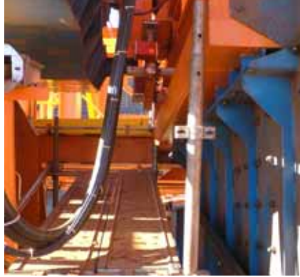
30 million tons yearly output