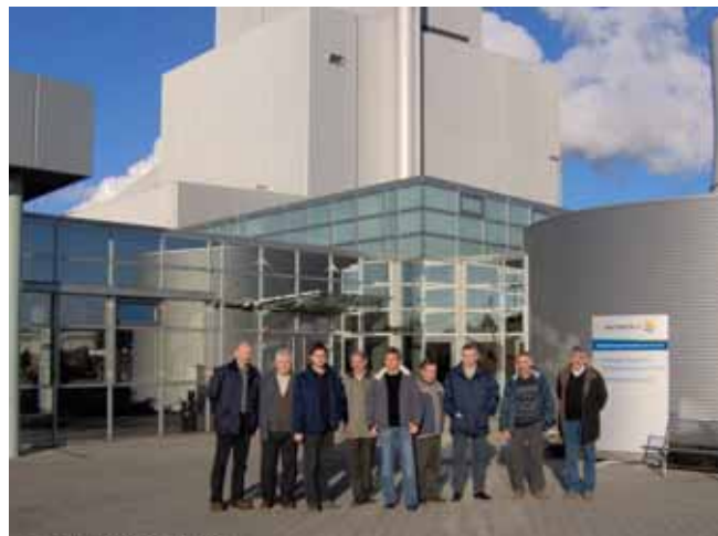
Visitors from Poland in Lignite Power Station in Boxberg (Oberlausitz)