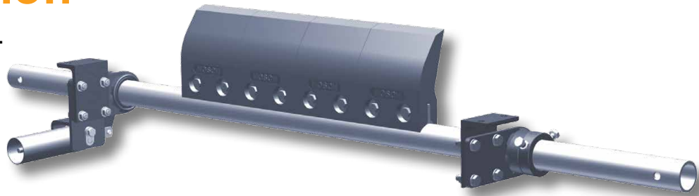
The HOSCH Type HD-PU-L prescraper will be launched in January 2017.

The task facing the HOSCH engineers was clear: Around the world, the high-