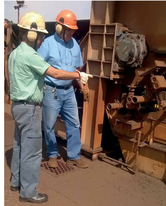
... and as a HOSCH employee (right) at long-term HOSCH customer Vale S. A.

But of course, there is also life after work. The father of three adult daughters (aged 42, 39 and 32) owns several 100 hectares of farmland. His farm is situated near Belo Horizonte, which also explains his love for the local soccer club Atlético Mineiro.