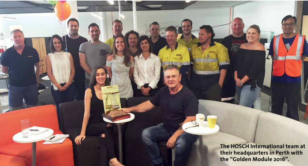
The HOSCH International team at their headquarters in Perth with the “Golden Module 2016”.

The arrival of the “Golden Module 2016” at HOSCH International was kept a secret until the very last minute