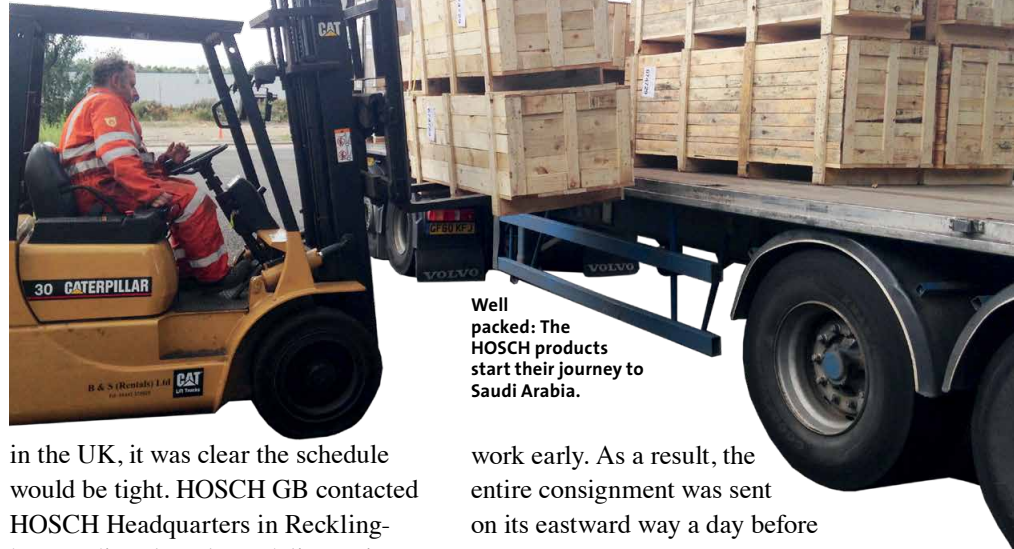
Well packed: The HOSCH products start their journey to Saudi Arabia.

When the order for a large number of scrapers and tracker rollers arrived