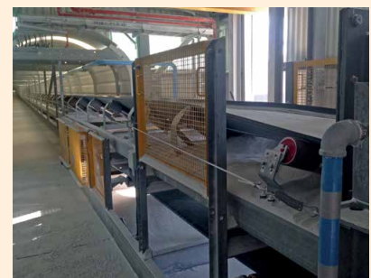
The conveyor in the aluminum plant runs for 16 hours a day.

belt conveyors, with a belt width of 1,000 mm and a total length of seven kilometers, convey the aluminum powder to the power plant 16 hours a day. The scrapers were installed by Anthony Emmanuelle from Ocean Rubber Factory (ORF) LLC., a HOSCH distribution and service partner, and Eddie Presch from HOSCH GB. The EMAL engineers were very satisfied with the installation, robust operation and overall performance of the HOSCH scrapers, and are already planning to