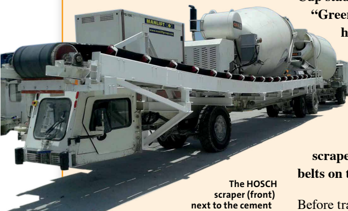
The HOSCH scraper (front) next to the cement mixer.

For use during underground track construction in Doha