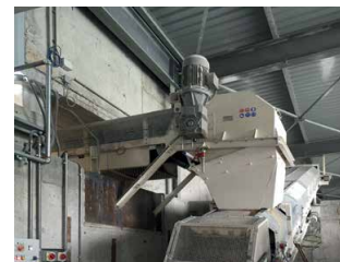
HOSCH scrapers clean up in the glass industry.

Their joint work has included a range of different projects in which HOSCH scrapers were installed on conveyors designed by STUDIMPIANTI SEI. The machines were used not only by the company in its glass factories in Italy, but also by partners in Germany, the UK and Poland.