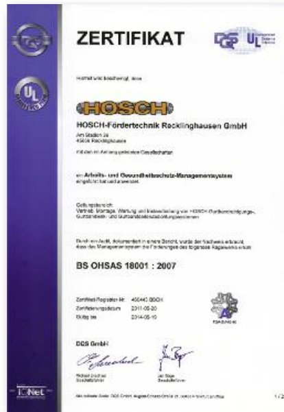
The official OH&S certificate issued to HOSCH Fördertechnik

The objective assessment was performed by DQS GmbH, which describes itself on its website as “an independent and