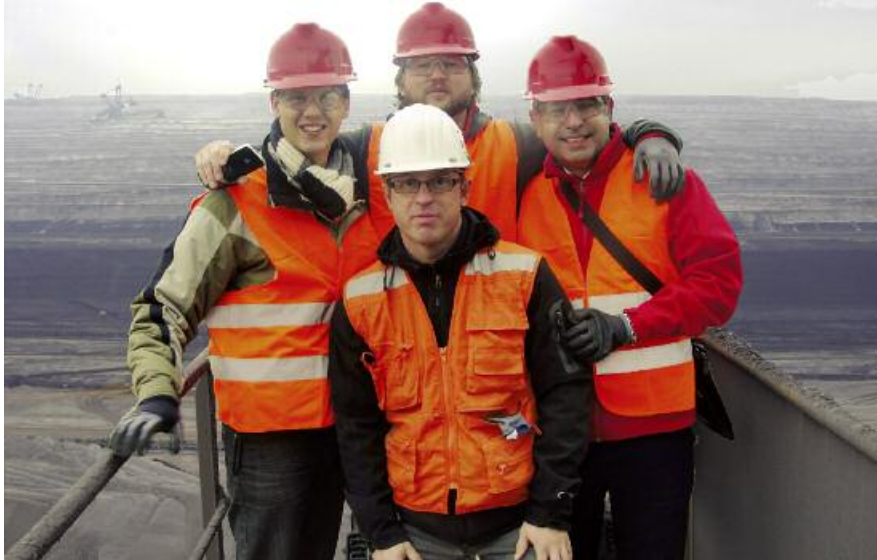
The training guests informed themselves at first hand at the Hambach Open-Cast Mines

Partnership with TTM Chile: customer visits, installations and training courses