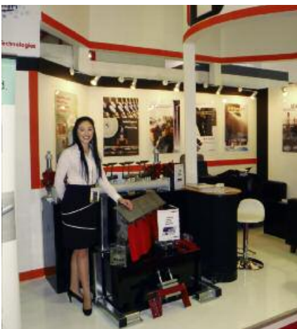
The HOSCH stand at the trade fair in Jakarta

Within the scope of its alliance with TTM, which also extends to Peru and Bolivia, HOSCH plans to become involved in additional business areas in South America. An especially promising project is the world's largest copper mine in Chuquicmata Codelco; here various carryback measurements have already been performed prior to the installation of HOSCH equipment.