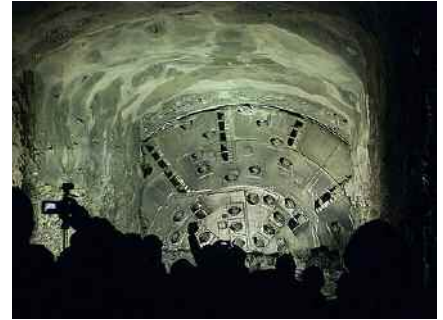
The breakthrough after almost five years: “Big Becky” finally sees light at the end of the tunnel

The project carried out by Ontario Power Generation and the Austrian construction company Strabag is designed to raise the capacity of the Sir Adam Beck Generating Station. It diverts the water of the Niagara Falls