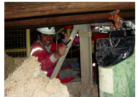
... didn't diminish the unfailing good spirits on site