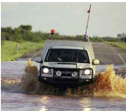
Streets were almost impassable after the monsoon