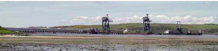
Import coal for all of Great Britain is transhipped at Clydeport Hunterston Terminal

Employees of the Clydeport Hunterston Terminal in Scotland visit HOSCH Headquarters in Recklinghausen