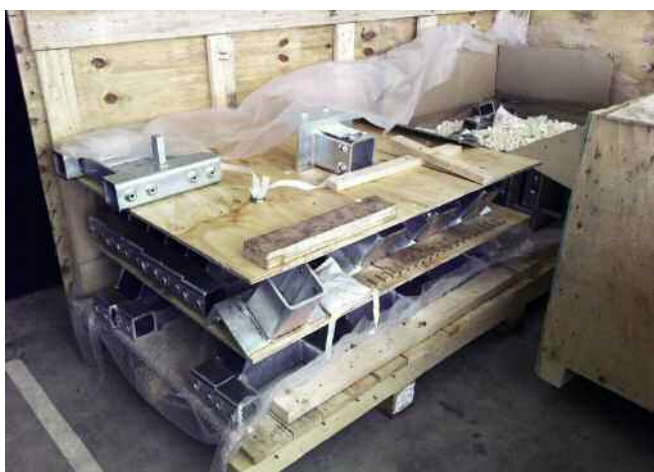
Even the tiniest parts get a barcode

After this, the customer decides whether it wants to entrust Kuhlmann with the packing or do the job itself. In the latter case it requires only packing material from Kuhlmann. Heidhues comments: "What is important for us is that Kuhlmann always reacts very flexibly. At its site in Marl, it has 2,000 square meters available for intermediate storage, order-picking and packing; this area can be expanded flexibly to meet increasing requirements."