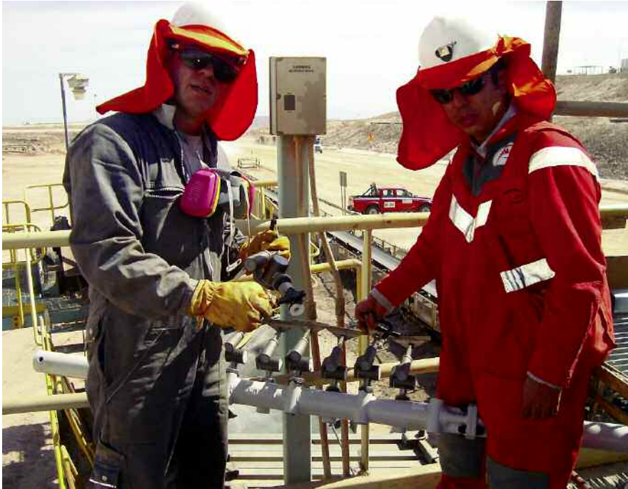
Heat and high altitude: the grueling conditions during the installation work in Chile ...

Since the beginning of 2011 TTM Chile is the official HOSCH distributor in Latin America