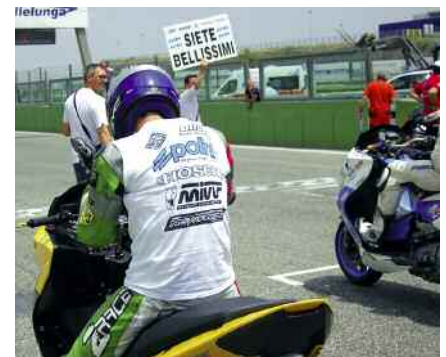
The scooter pilots speed over the Italian racing track in their HOSCH tricots