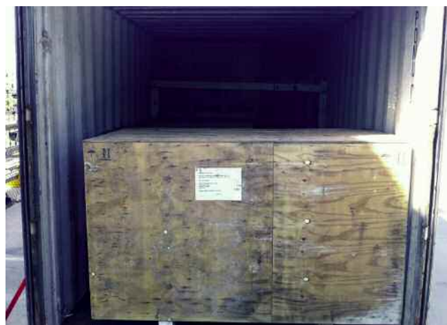
Seaworthy packing: the HOSCH crates are shipped overseas in a container