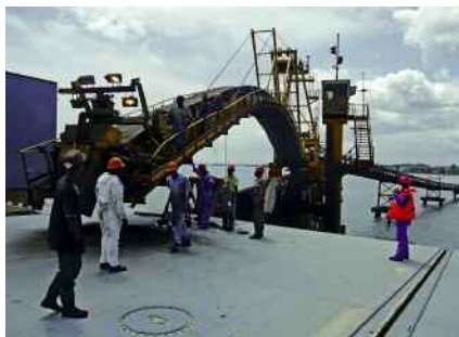
Preventing production outages at the port facility

HOSCH scrapers play an important role in the construction work for the tournament, which will be hosted jointly by Gabon and Equatorial Guinea from January 21 to February 12, 2012.